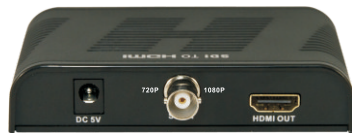
SDI TO HDMI Converter